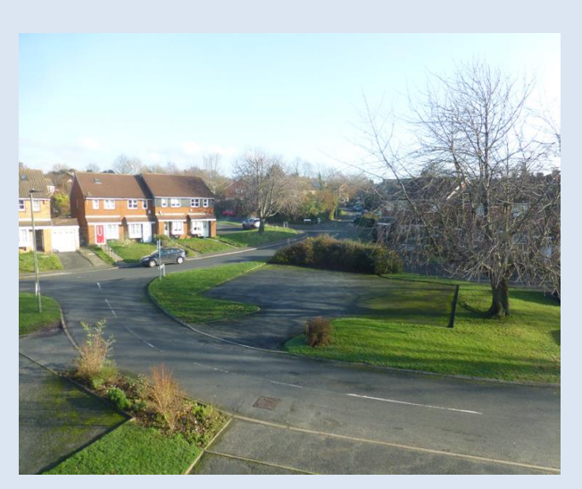
View from sitting room